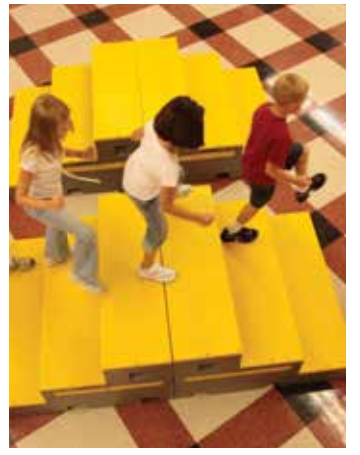
Standing Risers. Another simple flip creates great standing risers for the classroom or performances. Risers elevate students so they can be seen and heard by teachers and parents.

Tiered Seating. Flip the larger section onto the core to create two tiers of seating. Stable, comfortable, quiet seating that eliminates a room full of chairs without doing away with a place for students to sit.