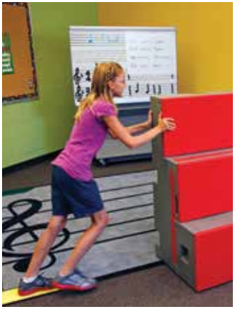
Out of the Way. flipFORMs tip up onto stable wheels and can easily be rolled out of the way and into compact storage. You'll be amazed at how quickly you can open up your room and move between lesson activities with flipFORMS.